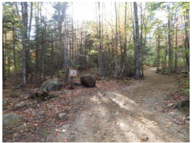
The story trail at Erickson Fields Preserve in Rockport.

ROCKPORT — Now that the fairies have made the most of spring and summer, shepherding the growing things through the warm months, what do they do when autumn comes, and the growing things begin to settle in to rest? How do the fairies prepare for winter?